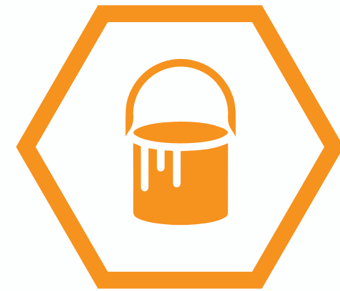
Paints & Specialty Coatings