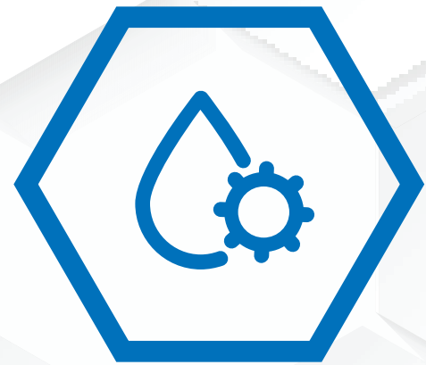
Oil and Gas

Aegex Technologies' 2nd Generation intrinsically safe tablet offers improved safety in several key measurements, and increased performance with enhanced memory and expanded storage. Operating in the most hazardous industries with explosive environments, Aegex solutions bring real-time connectivity to help organizations harness the power of data to optimize efficiency.