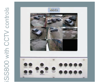
iSIS800 with CCTV controls

Choice of video inputs KVM extender (Cat 5 or fiber) Custom solutions available Glove-friendly touch screen Extended temperature