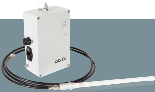
Wireless Access Point