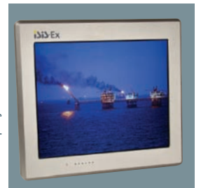
Zone 2 iSiS1202 - 19" display