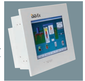
Zone 2 iSiS1202 - 15" display

It should be – it's the HMI you asked for.