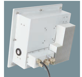
Zone 2 iSiS1202 rear